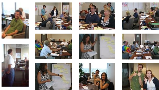
steering committee strategic planning retreat – august 21, 2010 holland & knight, jacksonville