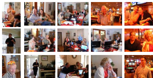
board of directors strategic planning retreat – july 30-31, 2010 reed residence, orange park