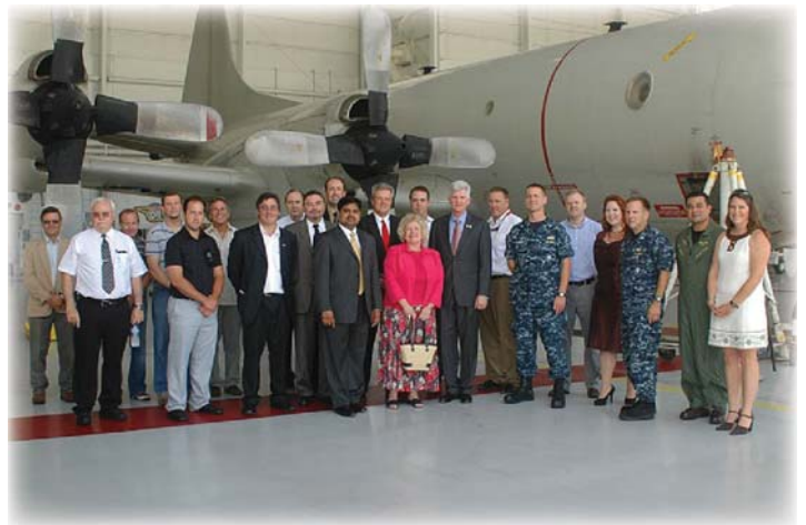
Several USGBC NF members attend the ceremony.