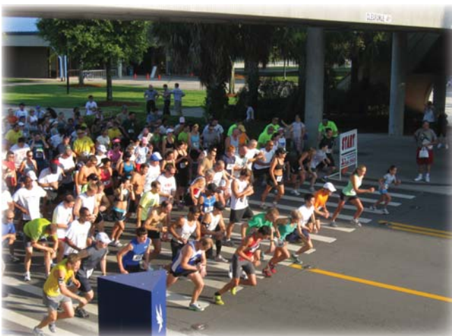
...and we're off