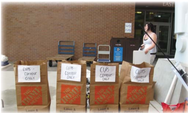
Recycling stations were set up for the event to help divert waste to the landfills. Collections were also taken for small electronics, and sneakers for recycling